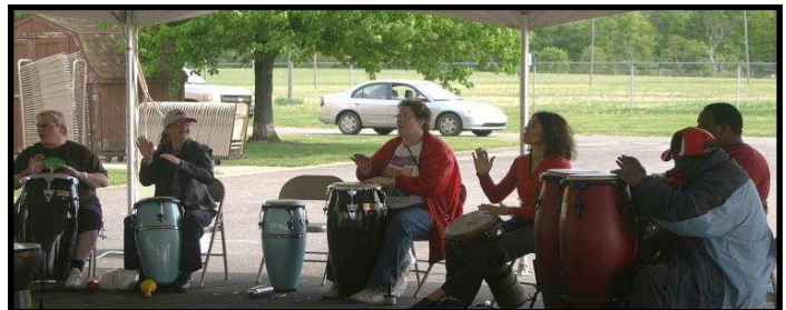
Above: As always, the MRC Drummers delighted Carnival goers at the Kalamazoo Wraps, 5th Annual, National Children’s Mental Health Awareness Day Carnival, May 6. Below: It seemed everyone took a turn at Bair Lake Bible Camp’s Ga-ga Pit (a form of dodgeball) during the event.